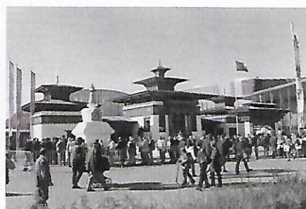
Bhutan's pavilion at EXPO 2000 in Hannover.

Two years ago, at the World Exhibition EXPO 2000 in Hannover, Germany, Bhutan made a great effort to present itself to a German and international public. Supported by Germany's Technical Cooperation Agency (GTZ), the country erected one of the most spectacular pavilions at the EXPO site – a beautiful lhakhang built in traditional style by Bhutanese craftsmen. The pavilion attracted millions of visitors and won an award as one of the best country presentations.