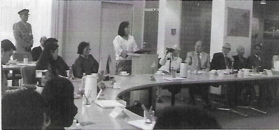
Queen Ashi Dorji Wangmo Wangchuk addressing the meeting of European Bhutan Friendship Societies in Hannover, July 2000.

den, Finland, Austria and Germany were represented by delegations. Chief Guest at the meeting was the Queen of Bhutan who thanked the European associations for their efforts to deepen relations between Bhutan and their respective countries. The meeting also served to discuss ideas for closer cooperation between European associations and joint activities in Bhutan.