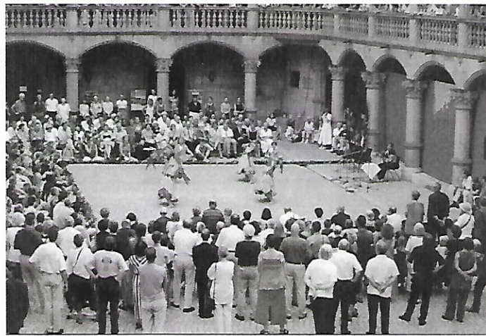
Bhutanese Dancers in Stuttgart's Old Castle courtyard performing to an enthusiastic audience.